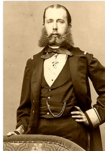
Maximilian I, represented the Church