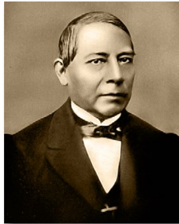
Benito Juarez, a Mason